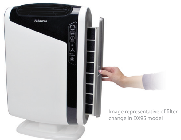
Image representative of filter change in DX95 model

Side drawer with built in grip handle allows for easy access to change the filter on the DX95 model. The DX5 requires the back panel to be removed for simple filter replacement.