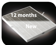
True HEPA Filter